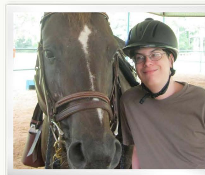
RIDER SUPPORT Such as helmets, adaptive riding equipment, saddles, therapy aids